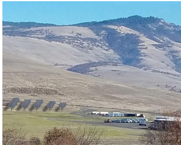
Model Perspective View