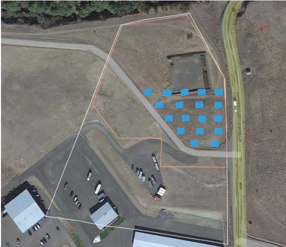
Suggested initial 200kW Layout

If this alternate project is desired, we request the City formally decide to pursue the project, and then provide a Letter of Intent to allow application to ODOE for the CREP grant.