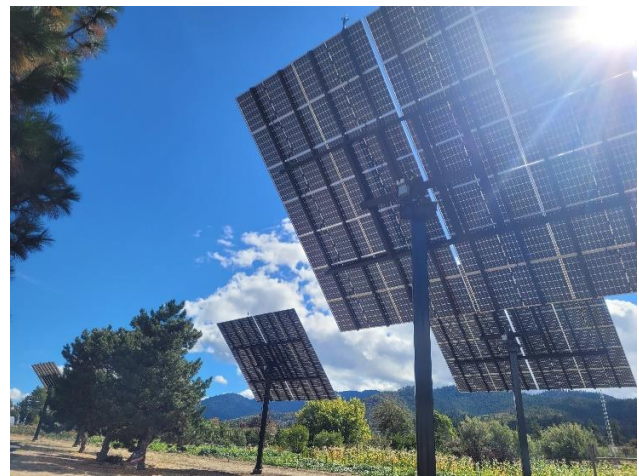
Proposed Dual-axis BiFacial PV Trackers