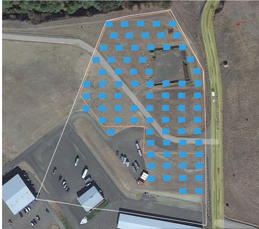
Possible Airport system Expansion for highest production 1MW System