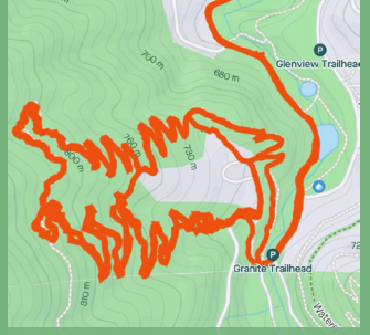
Map of the new Wasabi Trail

The 50+ miles of trails in the Ashland Watershed is made possible through collaboration with local groups like AWTA (Ashland Trails and Woodlands Association) and the RVMBA (Rogue Valley Mountain Bike Association) who volunteer their time and expertise in helping to create and maintain a world-class trail system!