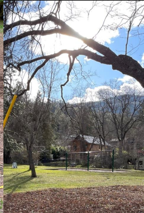
Glenwood Park: 4 benches in a circle (Former site of picnic table)