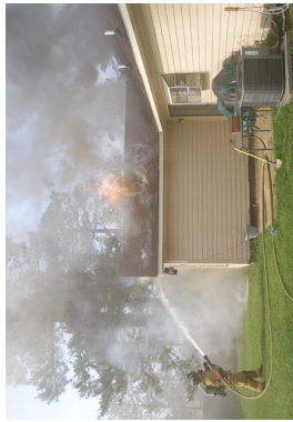
Preparedness is vital to overcome disasters

Working together as a team and contributing as an individual develops stronger communities and improves the quality of life in the community.