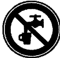
Universal Symbol for Non-Potable Water