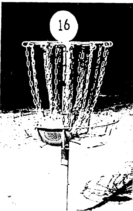
Figure 2: Sample disc golf basket or "Hole"

The Disc Golf course will require no construction activity. The tees will be made of 3 landscape timbers connected together and placed on the ground. The baskets will be self-contained units with only a small spike placed in the ground next to it and tethered to the basket to prevent theft.