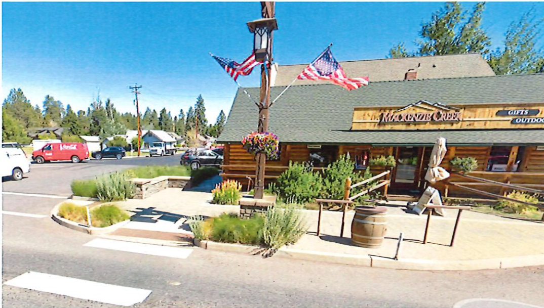
Planted Areas in curb (Sisters, OR)