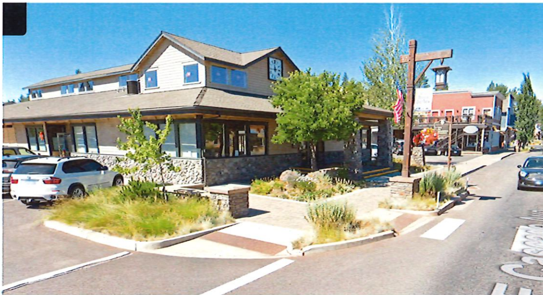
Planted Areas in curb (Sisters, OR)