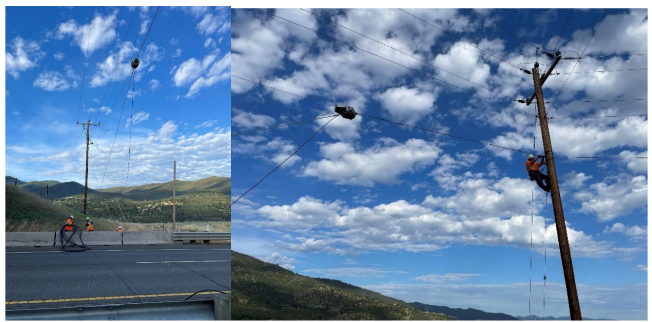
AFN pictures of pulling fiber across I-5

• AFN (Ashland Fiber Network): On Sunday, June 11 at 5 a.m., AFN staff came into work to pull our fiber across I-5 just north of the Butler Creek Rd overpass. We coordinated with ODOT, who performed a rolling slow-down of traffic and also blocked the on ramps. It took two crossings, one to pull the strand across and the second to pull the fiber and the lasher. The lasher is the large metal contraption up on the stand in four of the pictures (See photos at the end of report). AFN field staff did an excellent job of planning and executing