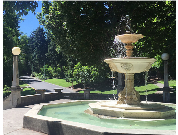
Butler-Perozzi Fountain in Lithia Park

Once completed, the project will protect an iconic piece of Ashland's history that has been the centerpiece of Lithia Park for over 100 years.