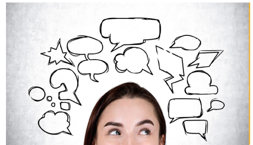
I'm curious about...

All of this and more at ashland.or.us/Curiosity .