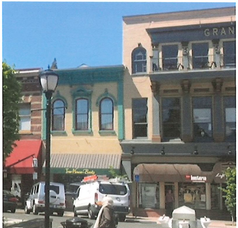
A continuous Retail / Restaurant Streetscape