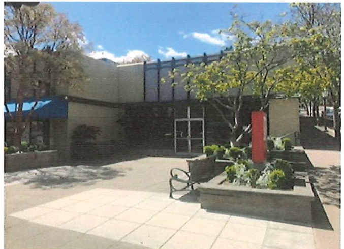
A series of Public Alleyways and Transient Gathering Areas