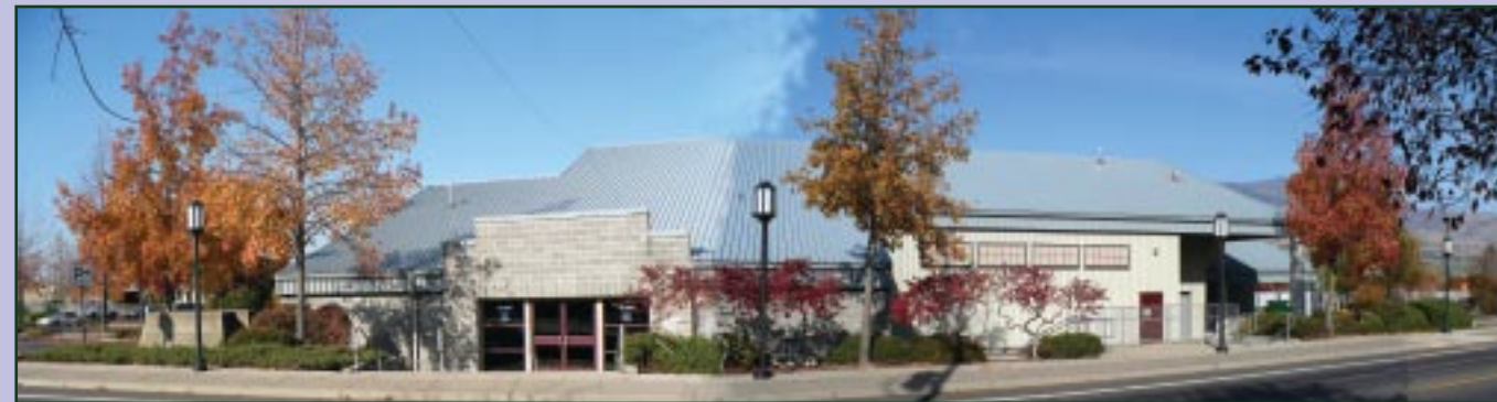
The Grove in Ashland

The Community Center, Pioneer Hall, Hunter Park Senior Center and the Grove are indoor facilities available to rent for events such as: Weddings, receptions, birthday parties, meetings, conferences, and more!