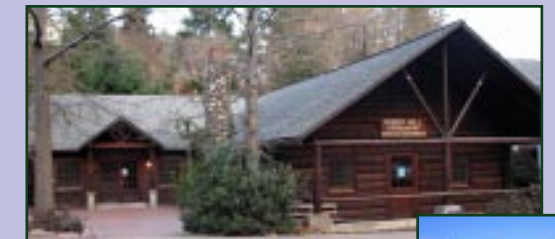
Above: Pioneer Hall in Lithia Park Right: Pavilion at North Mountain Park