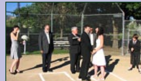
We have a little something for everyone; from a traditional wedding in Lithia Park, to an untraditional wedding on one of our baseball fields!