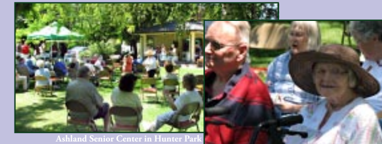
Ashland Senior Center in Hunter Park