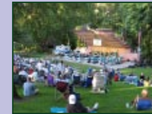
Lithia Park Bandshell

The Ashland Parks Department has several designated reservable sites to choose from including rustic natural areas with picnic tables and barbecues for groups up to 250 people, as well as small and large lush green lawns for those more intimate or formal gatherings.