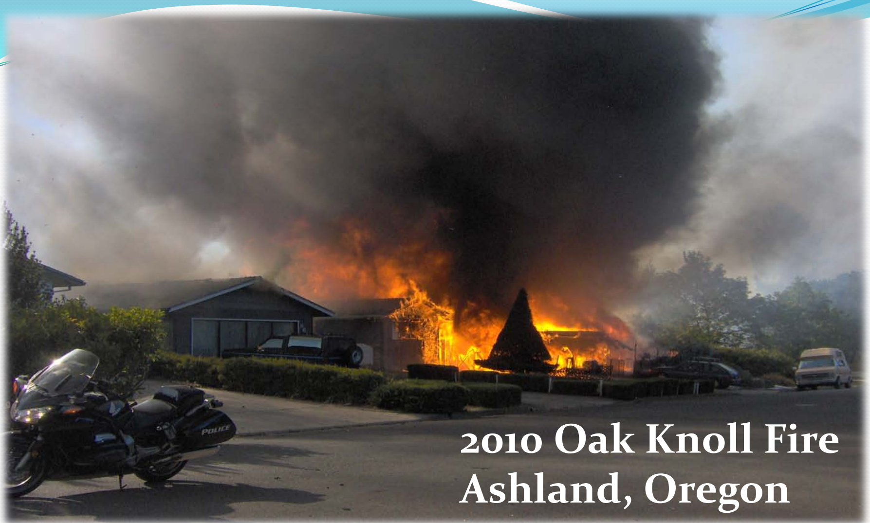
2010 Oak Knoll Fire Ashland, Oregon

Homes and landscaping are sometimes WORSE fire hazards than native vegetation.