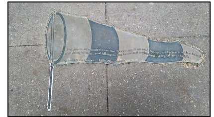
Photos: Example of Lit Walk plaques set in sidewalks in Iowa City, Iowa