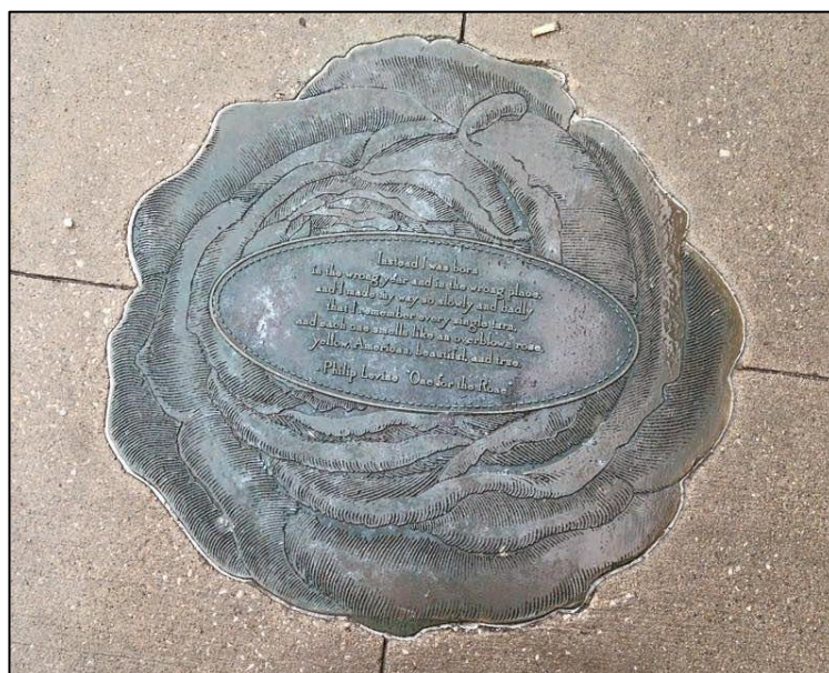
Photo: Example of Lit Walk plaque set in sidewalks in Iowa City, Iowa