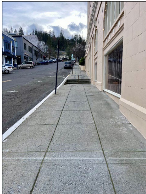
Photos: City of Ashland sidewalks downtown.