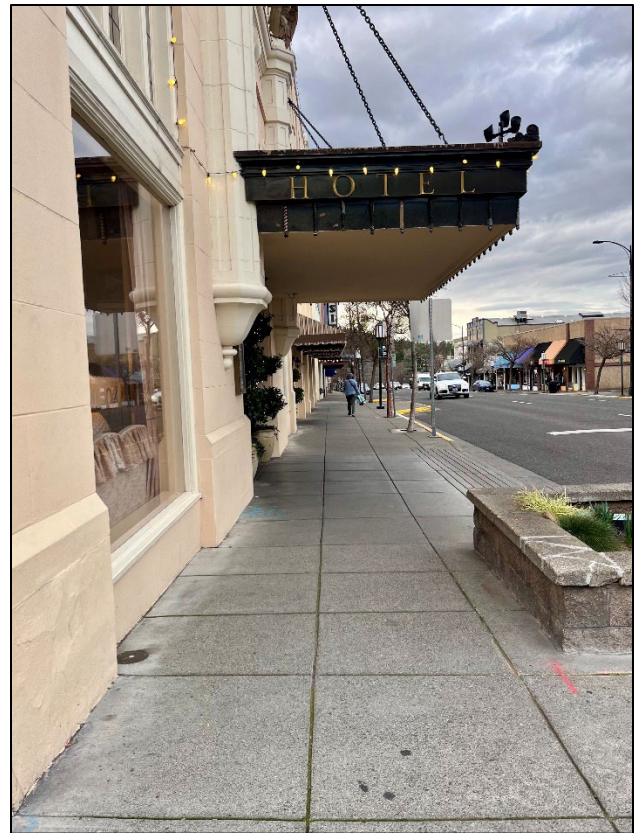
Photo: City of Ashland sidewalk on Main Street