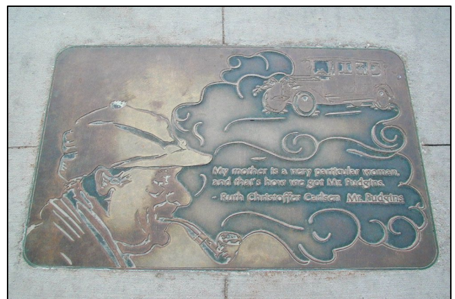
Photo: Example of Lit Walk plaque set in sidewalks in Iowa City, Iowa