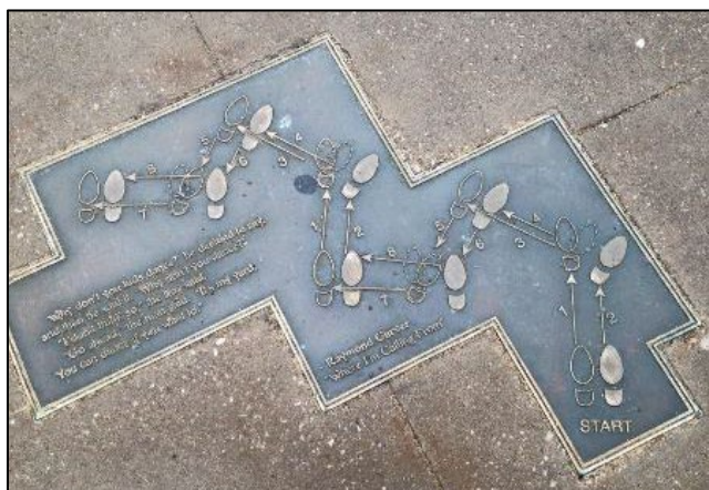
Photos: Examples of Lit Walk plaques set in sidewalks in Iowa City, Iowa

Interactive Story Map: The City of Ashland as a partner on this project could develop a Geographic Information System (GIS) Story Map that visitors can access online. The Ashland Playwright Walk would focus on the educational and interactive exploration of playwriting through technology and art, providing an engaging experience for visitors to connect with the timeless themes portrayed in theatrical works.