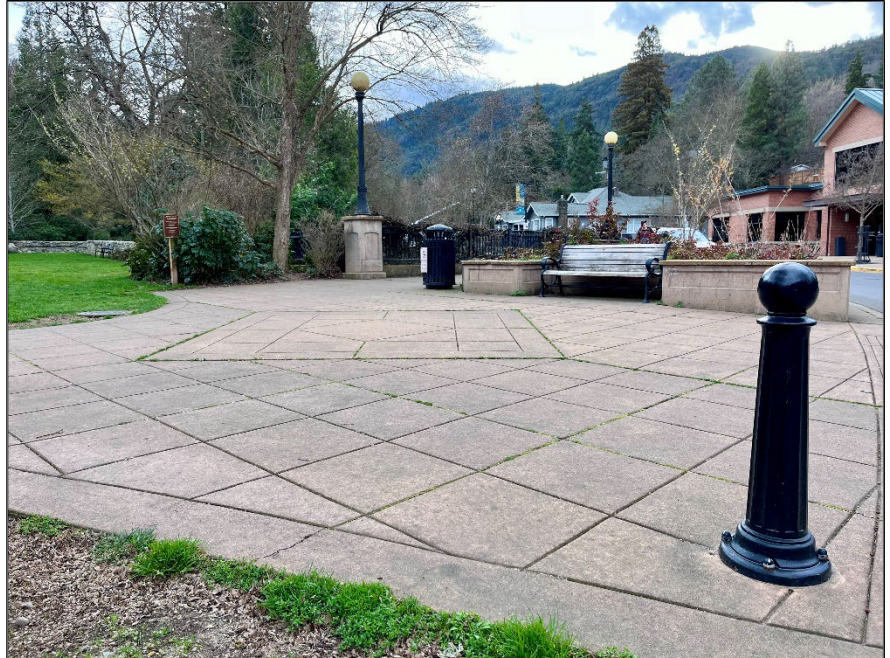
Photo: City of Ashland sidewalk near Plaza and Lithia Park.