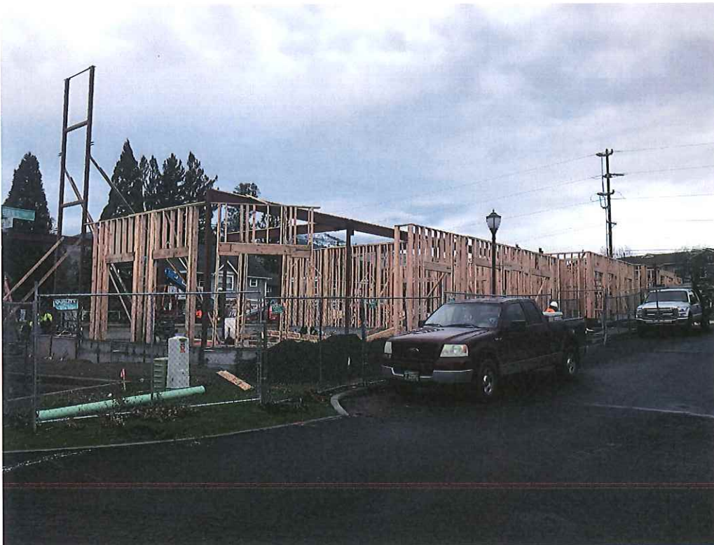
Meadowbrook Apartments (12.16.2020) Three-story Mixed-Use Building with “24” 500 sq. ft. apartments on 2 nd and 3 rd floors and “5” interim residential apartments on ground floor to eventually be converted to commercial office/retail use pending market demand.