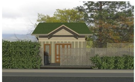
New Terrace Street Facility Rendering

This facility is critical in times of drought as it pumps raw water from the Ashland Canal to our water treatment plant providing the City an additional water source for treatment. We will be installing raw water pre-treatment equipment to assist with overall water quality in our distribution system. The Terrace Street Pump Station is located near 520 Terrace Street. This project will rebuild the existing facility that is outdated, inefficient and labor intensive, requiring manual operations. Currently, much of this facility is located below ground,