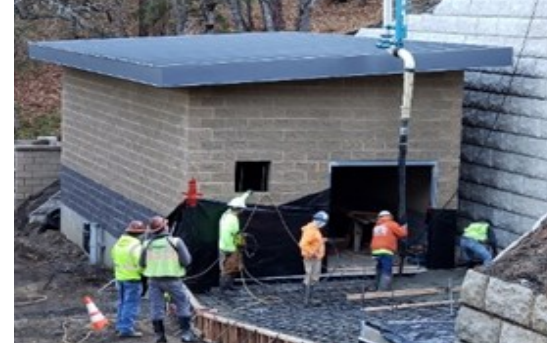
Recent Work on New Park Estates Facility

inefficient facility that has plagued staff with operational issues. When complete, this project will allow us to have pumping redundancy, improved water flow in the event of a fire and access to previously inaccessible water storage in the