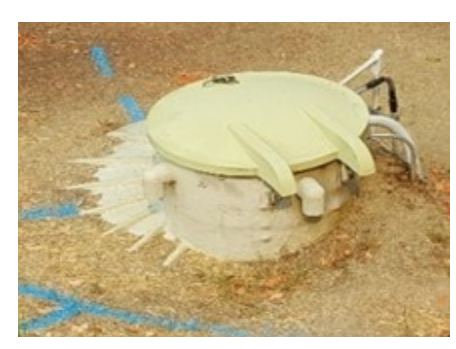
Current Park Estates Facility

This facility pumps potable water from Crowson Reservoir to our higher elevation customers. The Park Estates Pump Station is located near the intersection of Ashland Loop Road and Terrace Street. This project will replace the current outdated.