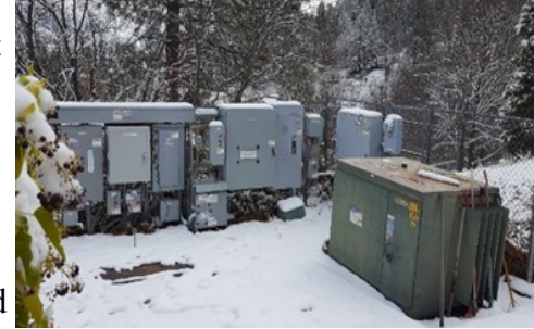
Current Terrace Street Facility

For project related questions or concerns please contact us in the Public Works Engineering Division at 541-488-5347. Project updates can be found on our website at <a href="http://gis.ashland.or.us/cipstorybook/">http://gis.ashland.or.us/cipstorybook/</a>.